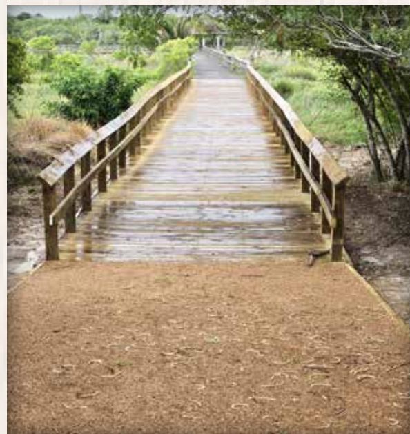
Oso Loop Trail connects to Wetland Boardwalk.

The committee also developed “ Garden Etiquette ” signage now on site, which includes prohibiting firearms and other lethal weapons inside the Gardens .