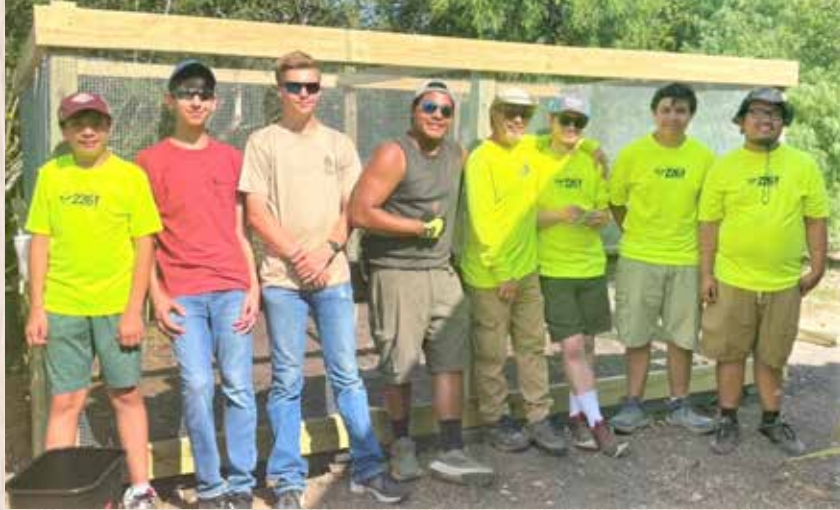
Scout Troop 226 stand in front of finished Texas Tortoise Pen.