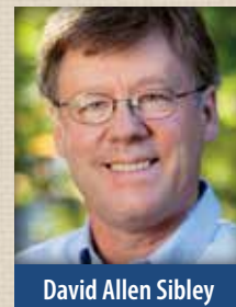
David Allen Sibley