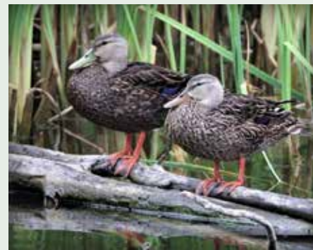
MOTTLED DUCKS, Denise Housler